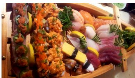
SUSHIYA BIG BOAT