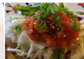
POKI S.TUNA SALAD