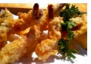
VEGI AND SHRIMP