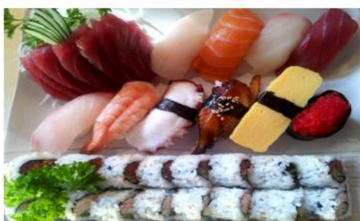
MISAKO NIGIRI COMBO